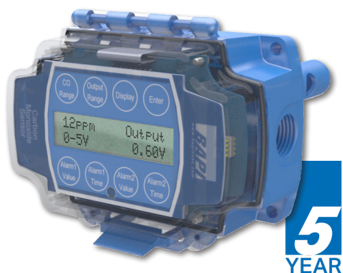
Rough Service (top) and Duct CO Sensors